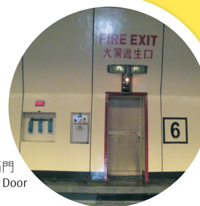
隧道分隔門 Cross-Passage Door